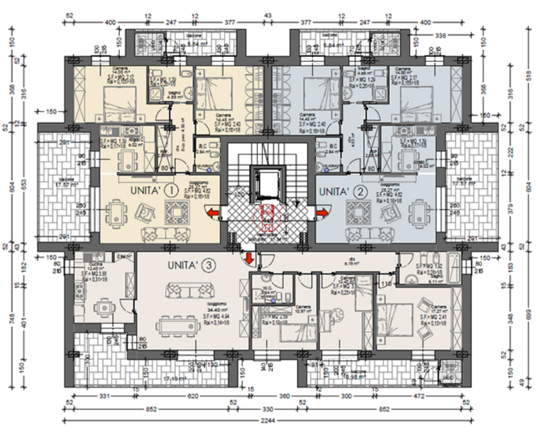
Planimetria P. 1°- 2° - 3°